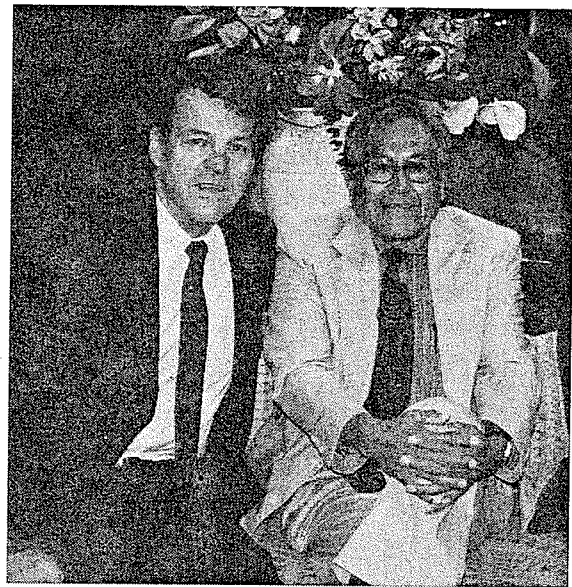
Advisory Committee members